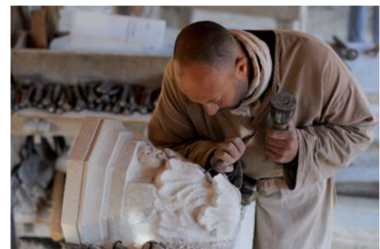
dressing a corbel for the future vault

The woodworkers and the carpenters are building a temporary bridge which will span the deep ditch to the east of the castle. This bridge will be needed once work on the southern curtain wall begins in earnest in a few seasons from now.