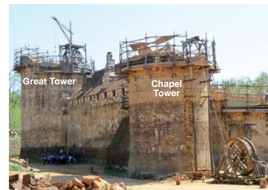
the castle's northern side