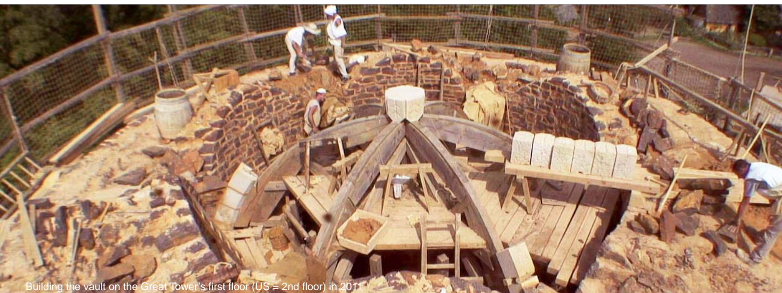
Building the vault on the Great Tower's first floor (US = 2nd floor) in 2011