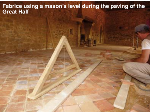
Fabrice using a mason's level during the paving of the Great Hall

The floor of the Great Hall, the reception room on the first floor (US = 2nd floor) has been covered with paving tiles. The latest firing of the tile kiln last week will provide enough tiles to complete the paving of this chamber in the coming weeks.