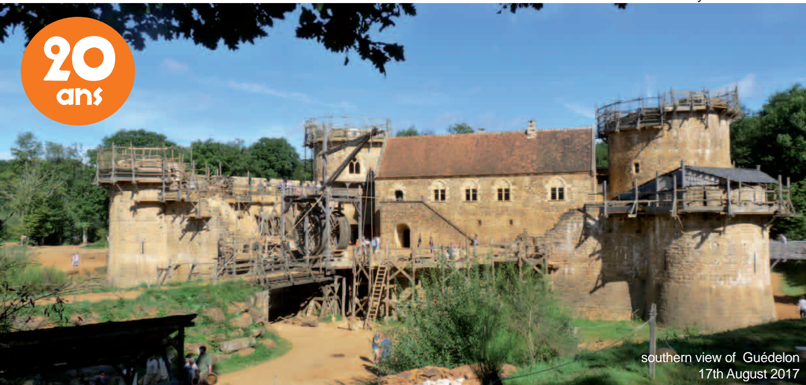
southern view of Guédelon 17th August 2017