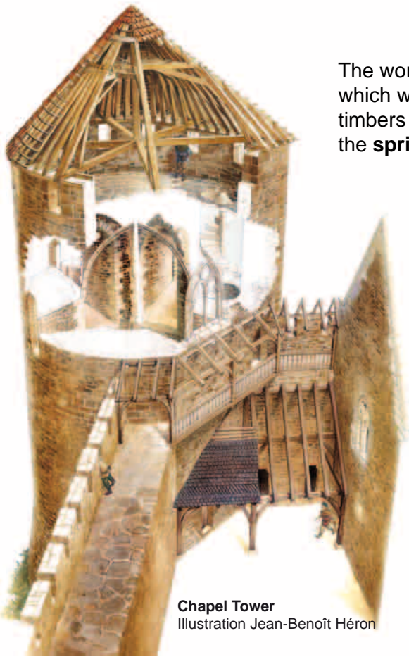
Chapel Tower Illustration Jean-Benoît Héron

The work of squaring up, making and assembling the numerous oak timbers which will form the roof timbers of the Chapel Tower is underway. These roof timbers are due to be transported and assembled on the tower's summit in the spring of 2018 .